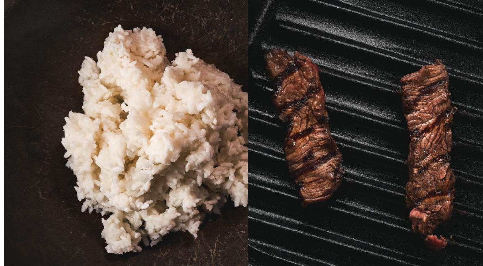
PLATE: (In order) Rice, beef, ginger, and onion

GARNISH: Peel and grate ginger. Soak onion in ice cold water.